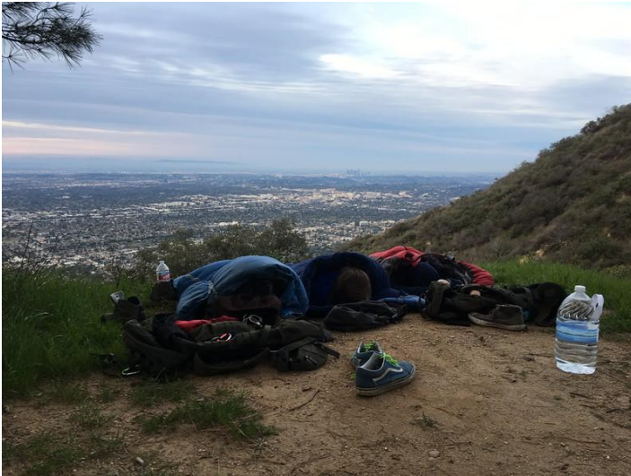
Sleeping on the edge