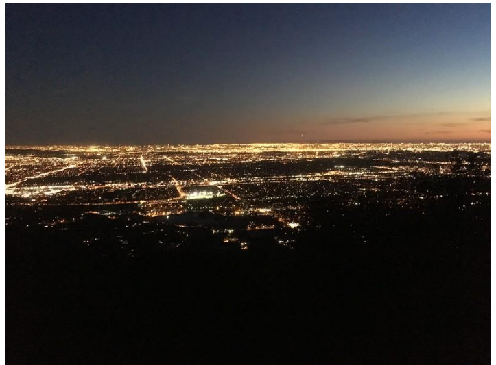
City at night

The ranger is very friendly, and the visitor center is interesting. We didn't have any encounters with dangerous or nuisance wildlife, but the camp does have food storage boxes to keep your food safe from raccoons (they are wooden, so I don't think they would stop bears). By the way, the food boxes were an Eagle project.